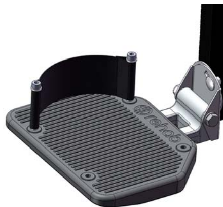
Diagram 2. Finished!