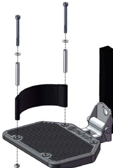
Diagram 1. Assemble the screws, washers, tubes, heel loops, foot plate and nuts according to the figure. Use an Allen key (5 mm). Tighten the screws securely.

The heel loops are mounted in the rear holes of the foot plate.